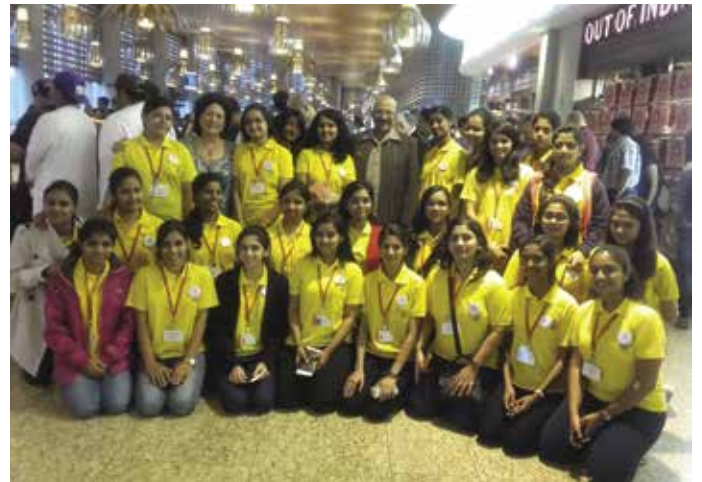
The girls get ready to board the flight

The Peace Ambassadors had all gathered near the LPF Office, to begin the first leg of their Journey. A special bus was arranged from Pune for the girls and Mom and Dad. The Peace Ambassadors had an impromptu photo shoot before leaving after which they bid farewell to their Parents. After all tears, Mom and Dad along with the girls boarded the bus to Mumbai, eagerly awaiting the next step of the Journey. Tune in to the next issue of Inspira, to know more about the next phase of their Journey towards becoming the Peace Ambassadors in every sense of the word.