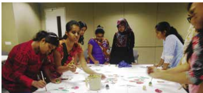
The girls busy in creating their own Floral Masterpiece at MAD-Masti Arts Dhamaal; a Art Program.