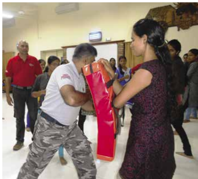
Attack and Block: The trainers of the Reflex Quotient Team explaining the girls how to block your attacker while giving them the training for Self Defence.