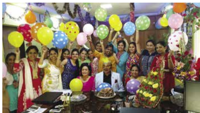
Mom and Dad pose with the LPF Office Staff during the office celebrations

Like all good things, these function to come to an end but not without a bang.