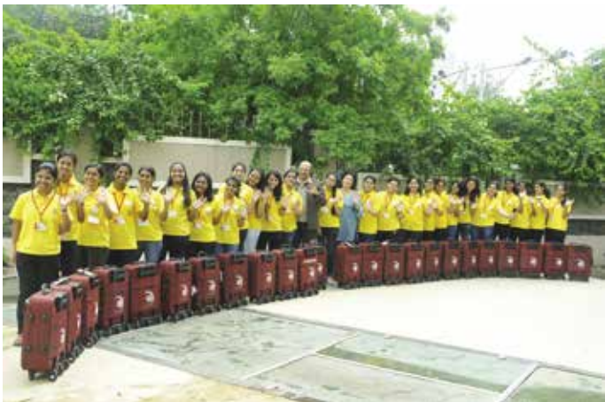
The Peace Ambassadors, Batch of 2016., Mom and Dad wave goodbye.