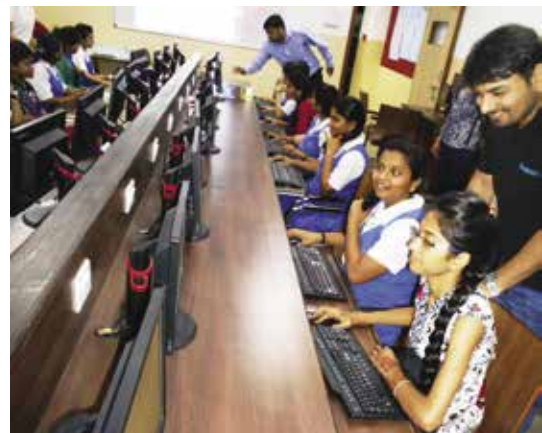
Spreading Smiles: The LJs from St. Clare's share a laugh with the volunteer as the practical session begins during the Computer Training by Barclay's in Orchid School Batch 2012 (Standard 10 th ).