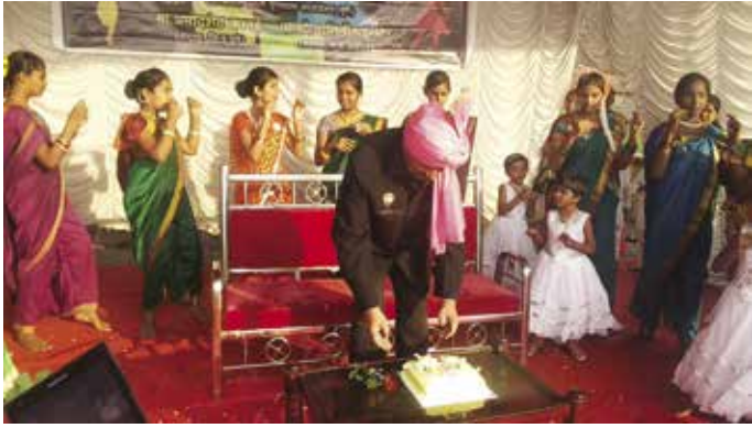
Dad looking handsome as ever with a turban, celebrates his birthday with his beloved Lila Juniors at Chandoli.