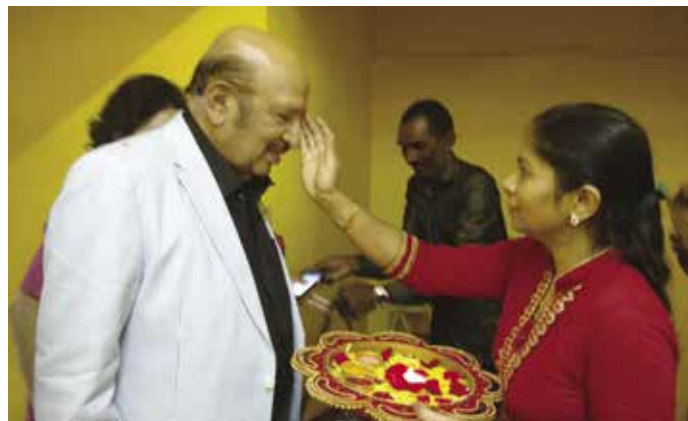
Traditional Welcome for Dad

The festivities began with the Traditional Welcome of Mom and Dad, complete with Lezhim and Brass Bands. The Lila Fellows gave a breathtaking performance for their beloved Dad. The celebrations continued with the LJs humming the quintessential birthday song "Tum Jiyo Hazaro Saal" especially for Dad, then came the cake cutting and Surprises. After the Cake