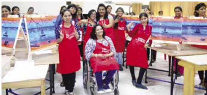
Masti and Majja: Lila Girls and the artists goofing with each other at the Painting Workshop with Sundown Stroke at SKF, India.