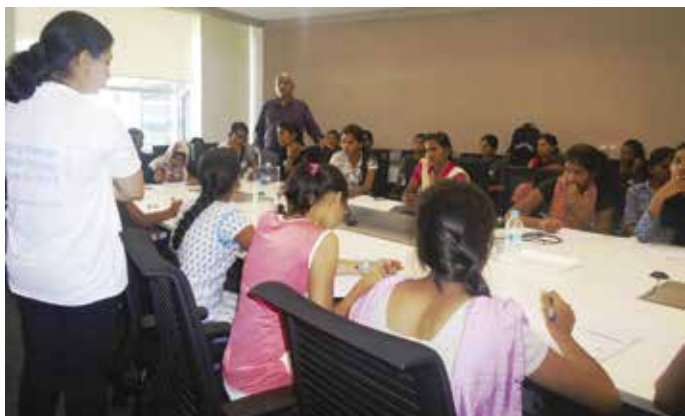
Lila girls checking the answers to the questions of aptitude test during the Communication Skills and Career Guidance Program at Barclays Technology Centre.