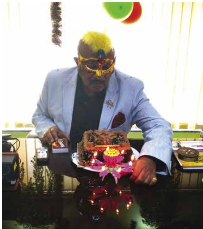
Dad gets ready to cut the cake

The month of April, sure turned out to be a special one for LJs, LGs, LFs and their Beloved Dad. Reason being, Dad's Surprise Birthday Party, which they helped organized and arranged. The days were 20 th and 21 st of April, when the past and present LJs, LGs and LFs, all dressed beautifully gathered at the S.G Barve Hall, Alpa Bachat Bhavan to celebrate their Dad completing 79 Years.