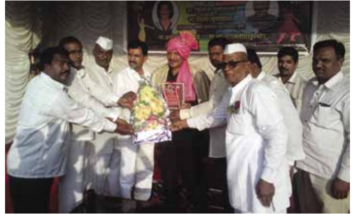
Dad was felicated by the School Committee Members at Chandoli